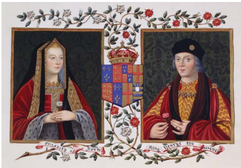
Henry VII and his queen Elizabeth of York.