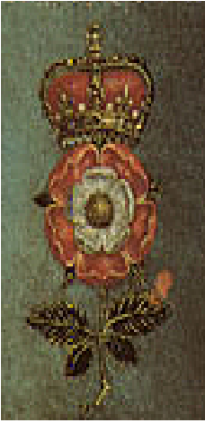
The Tudor Rose of England.

The open secret to the British monarchy's optimal health and well being during King HENRY VII Tudor 1485. He was the only son of Edmund Tudor and Margaret Beaufort. The Tudors belonged to one of England's most powerful families – the family of Lancaster. The Lancastrians were constantly fighting with the family of York over rival claims. He married Elizabeth of York and so united the two warring houses, York and Lancaster.