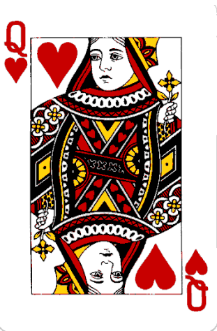
A portrait of Elizabeth is the basis for the queen's picture found in a deck of cards.